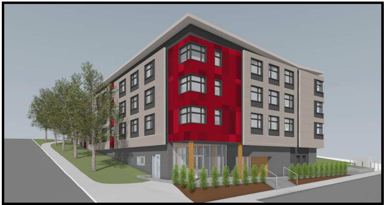
Figure 1: Proposed multi-unit building shown from the corner of Buller Street and Third Avenue

An 18 space parking lot is proposed to be accessed off the laneway. There is a grade change between the parking lot and Third Avenue, so a retaining wall is proposed parallel to Third Avenue along the edge of the parking lot. A small greenspace is proposed in the northeast corner of the property adjacent to Third Avenue. Bicycle parking, benches and a picnic table are proposed near the residential entrance off the parking lot. There is another landscaped area along the western property line, where there will be a landscaped buffer and garden plots.