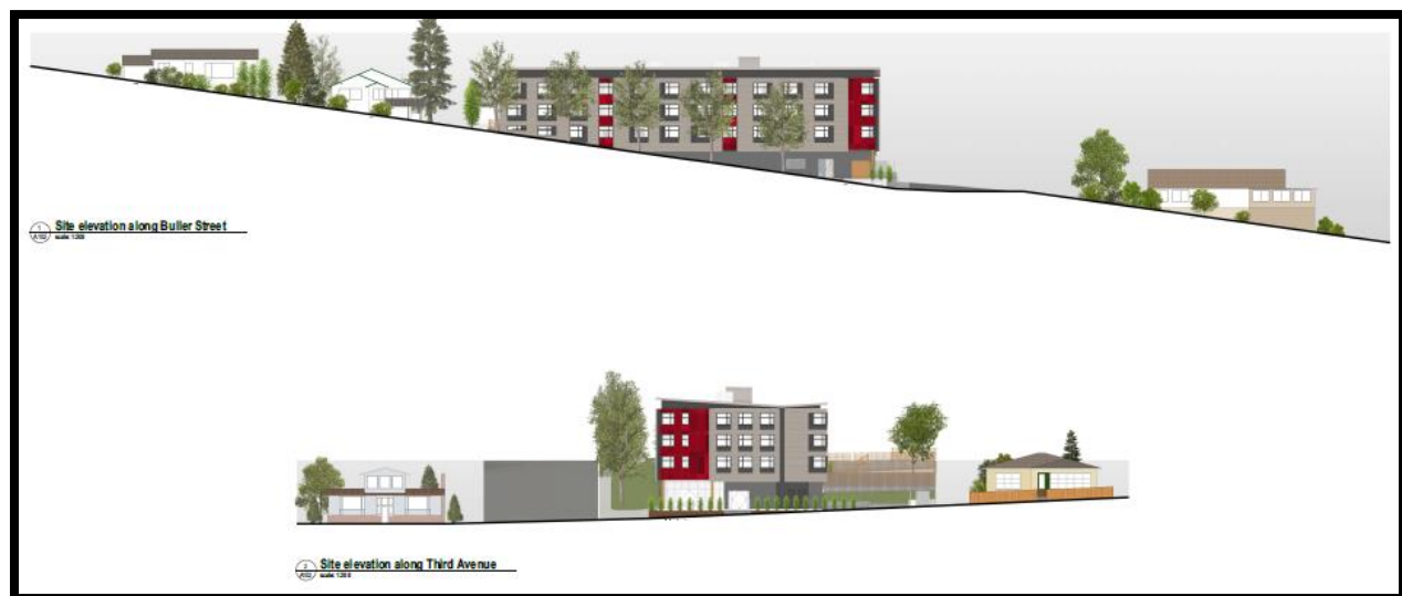
Figure 2: Height relative to adjacent buildings