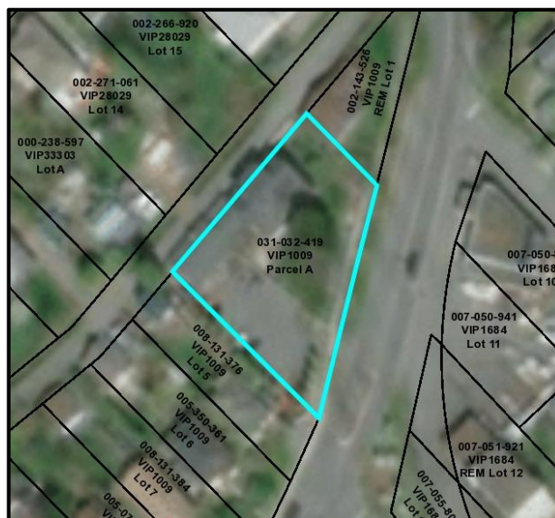
Figure 1: Subject property highlighted in blue; showing lot consolidation.

On December 16 th , 2019 Council gave Bylaws 2027, 2028 and 2029 first and second reading and authorized the bylaws to proceed to public hearing. The applicant was also asked to consolidate the three lots that make up the subject property prior to final adoption of Bylaw 2029. OCP amendment Bylaws 2027 and 2028 were adopted by Council following the public hearing on January 21 st , 2020. Bylaw 2029 is now returning to Council for final adoption as it has been signed by MOTI and the lots have been consolidated by the applicant.